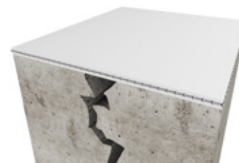
4. KÖSTER Superfleece is applied into the fresh first layer