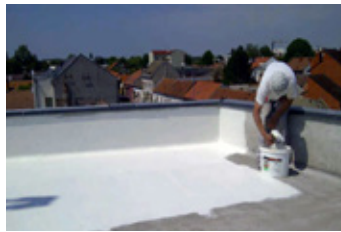
3. First layer of KÖSTER 21