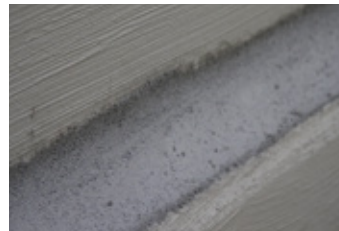
2. Fillet installed with KÖSTER Repair Mortar