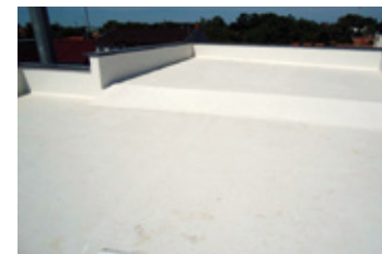
6. Final result