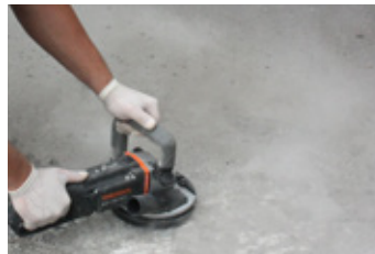
1. Substrate preparation