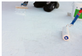
5. Second layer of KÖSTER 21